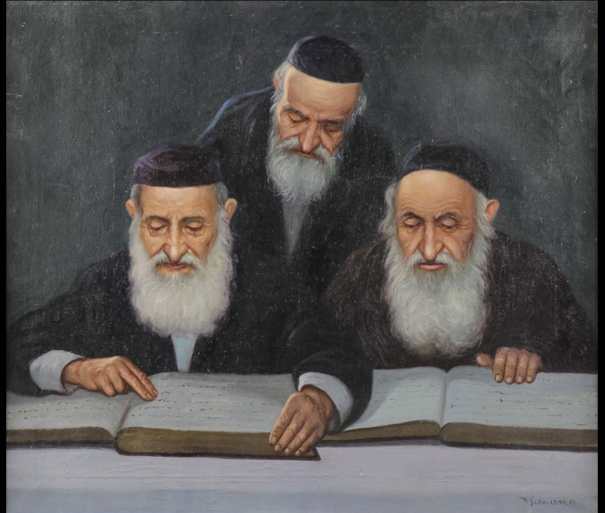
Rabbis Studying Scripture – Konstanty Szewczenko