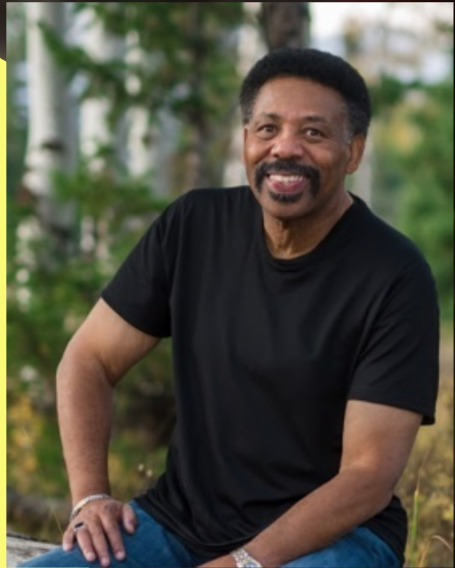
Tony Evans, Bible Teacher and Commentator

It's possible to have a useless faith that's not accomplishing anything in life. If you say you trust God, it should affect your feet. Once you become a Christian by faith alone, your faith has to get married to works. Then, what you believe about eternity will become real in your history.