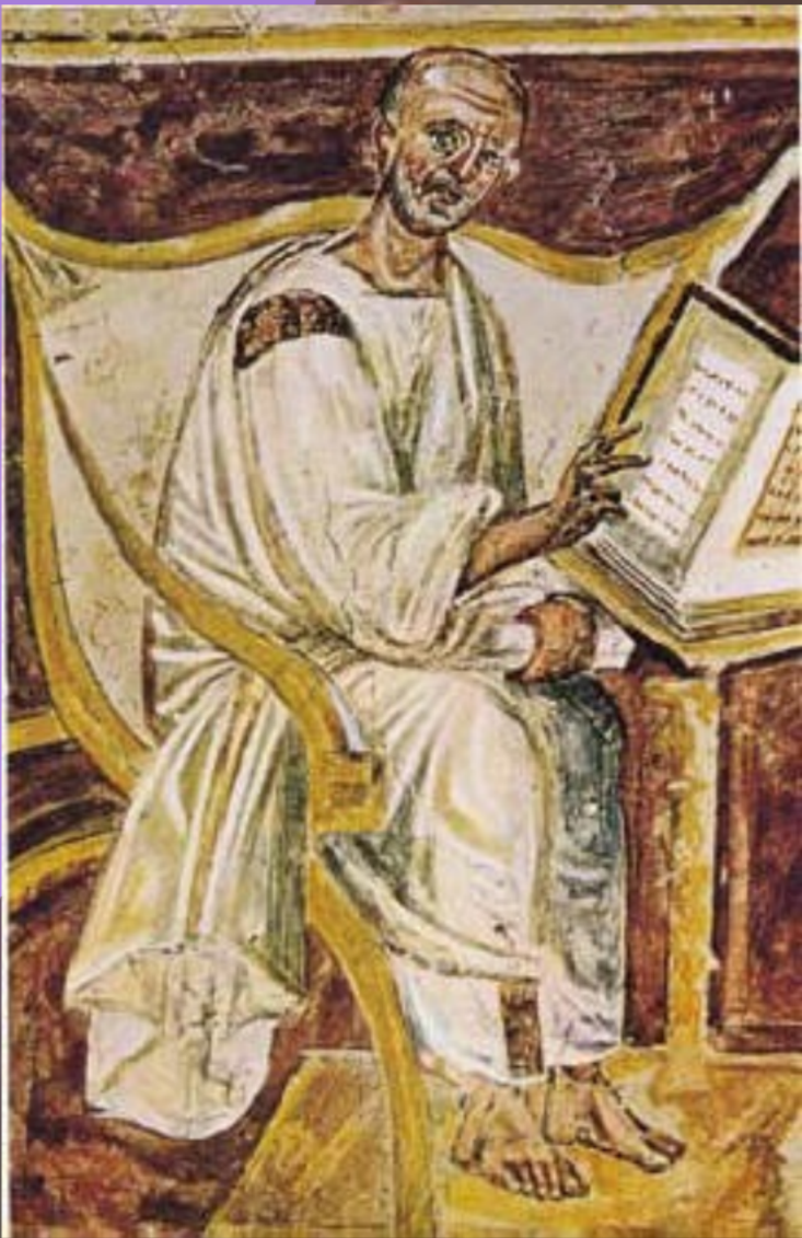
St. Augustine (354 - 430) Bishop and Theologian in the Ancient Church

Paul said that a man is justified through faith without the works of the law, but not without those works of which James speaks.