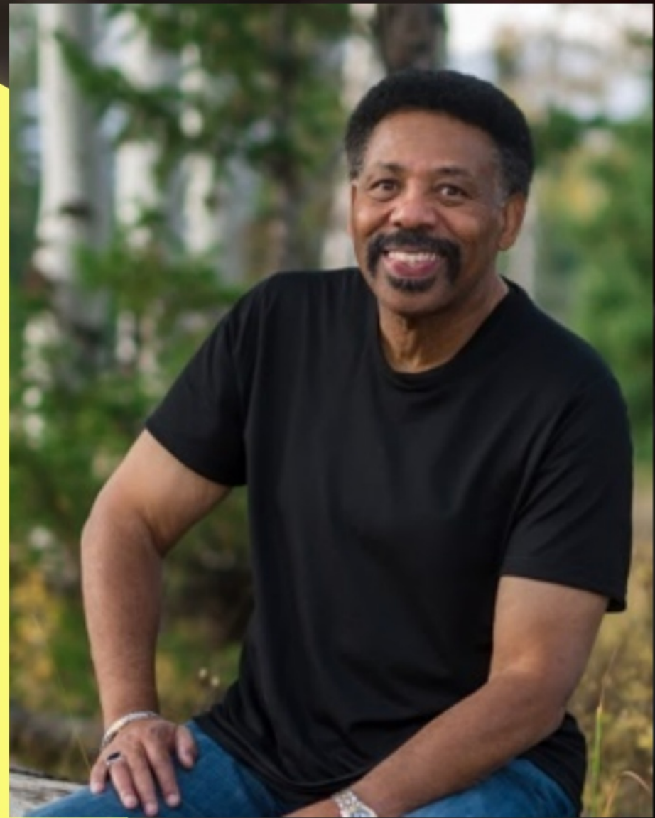
Tony Evans, Bible Teacher and Commentator

James is the in-your-face, no-holds-barred apostle. He says in essence, “If you are going to be a Christian, be a real one.” This book thus explains what practical Christianity looks like. It’s about living out your faith in everyday situations with everyday people, and doing it victoriously.