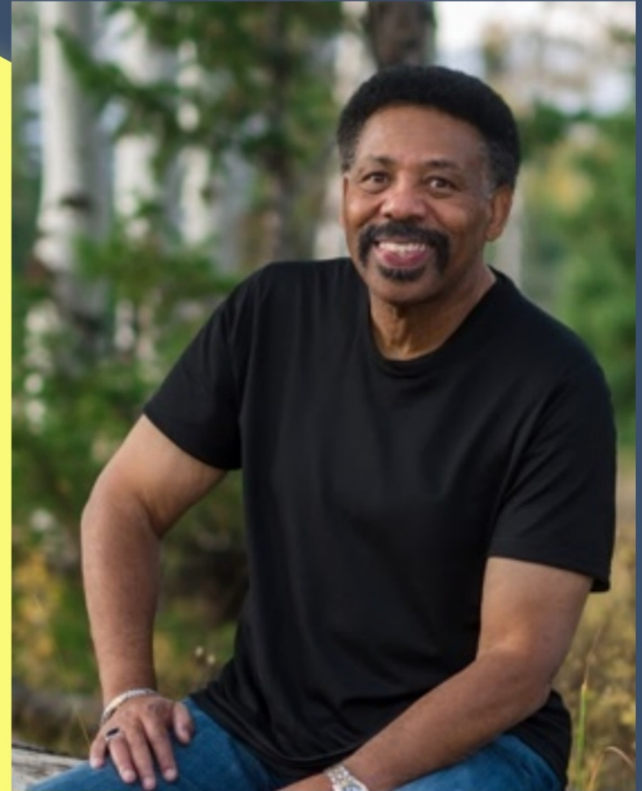
Tony Evans, Bible Teacher and Commentator

A mirror shows the reality. It exposes what you look like, but it can't change you. It won't comb your hair or brush your teeth. To look in a mirror is a call to action.