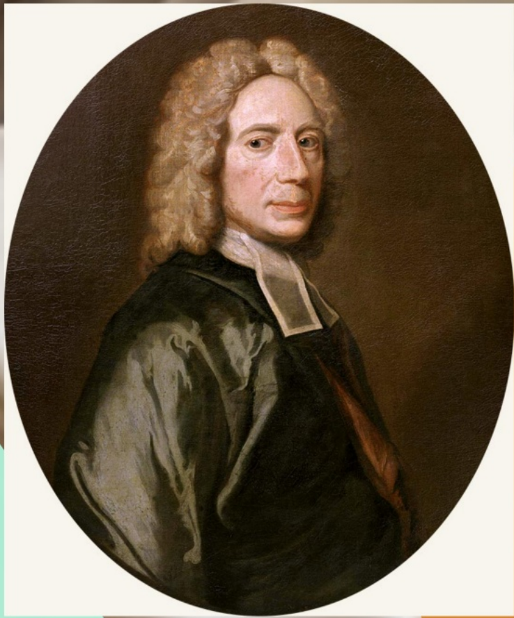
Isaac Watts (1674 - 1748), English Minister and Hymn Writer

Not all the blood of beasts On Jewish altars slain Could give the guilty conscience peace Nor wash away one stain.