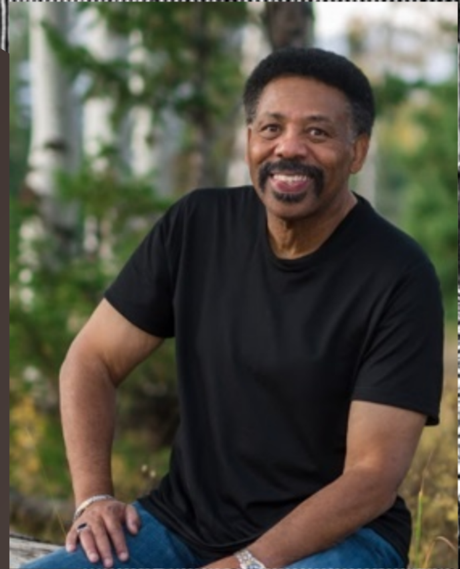
Tony Evans, Bible Teacher and Commentator

Qualified spiritual leadership is critical for a church to function properly. Titus's twofold task was the identification of such leadership and the teaching of sound doctrine. Titus wasn't left to wonder who should fill these kingdom positions because Paul provides a list of virtues and traits for elders ... Notice that these are not descriptions of performance but of character.