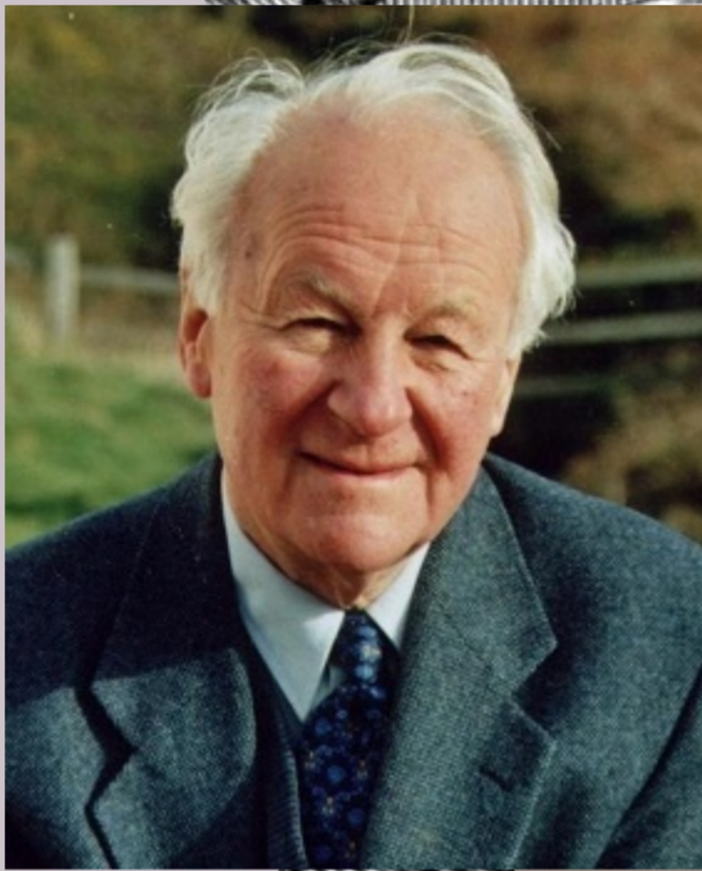
John Stott (1921 - 2011)

Candidates for the pastorate must give visible evidence in their behaviour that they have been regenerated by the Holy Spirit, that their new birth has led to a new life, that their fallen passions are under control, and that the ninefold fruit of the Spirit has at least begun to appear and to ripen in their lives.