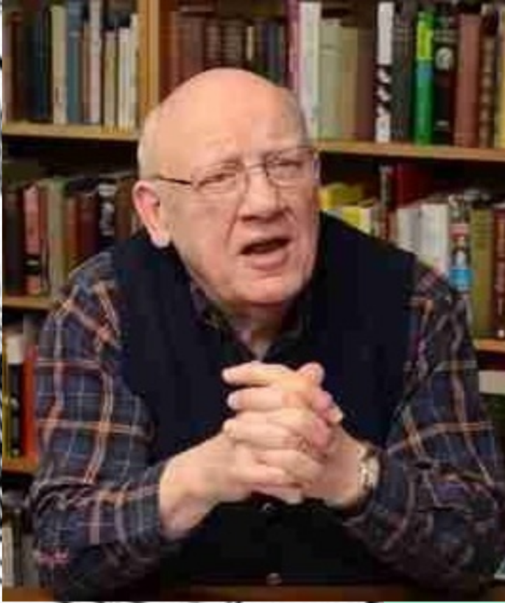
Warren Wiersbe (1929 - 2019), pastor and Bible teacher.

One reason Paul had left Titus on the island of Crete was that he might organize the local assemblies and "set in order" the things that were lacking. That phrase is a medical term; it was applied to the setting of a crooked limb. Titus was not the spiritual dictator of the island, but he was Paul's official apostolic representative with authority to work.