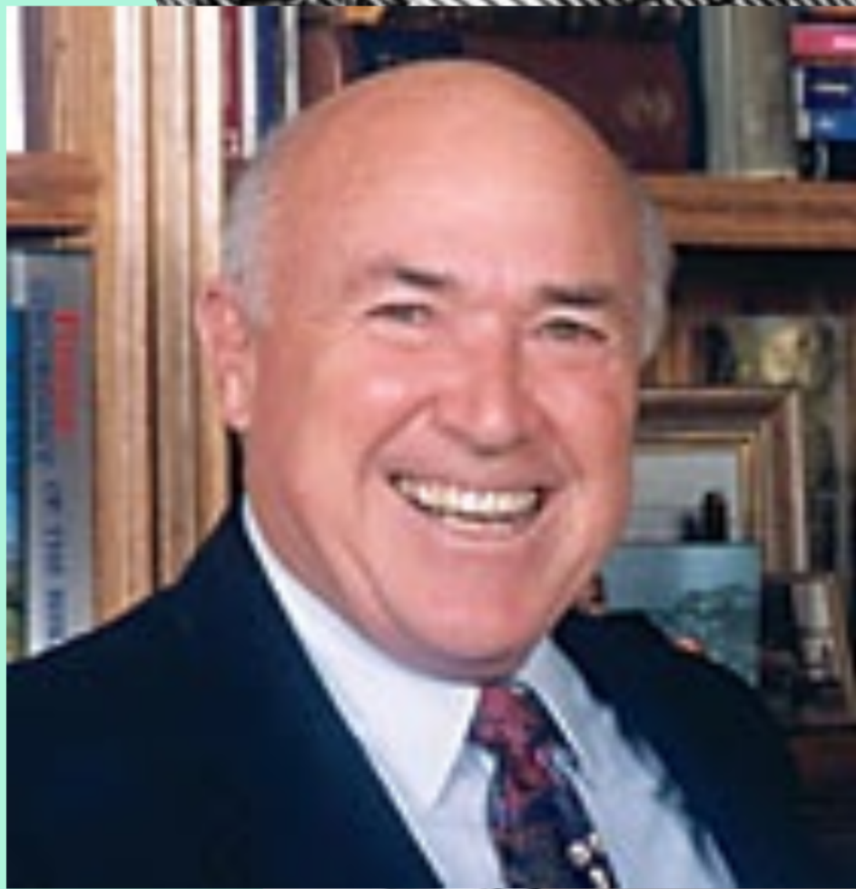
Chuck Smith (1927-2013), founding pastor of the Calvary Chapel Movement

3:12 This is one of my least favorite promises in the Bible. I don't think anyone prints this promise on a promise card or in a book of Bible promises, but it is a promise just the same ... You can't escape it, so don't even try ... It is a dangerous thing to try to curry favor from the world. If you seek godliness, you will be persecuted.