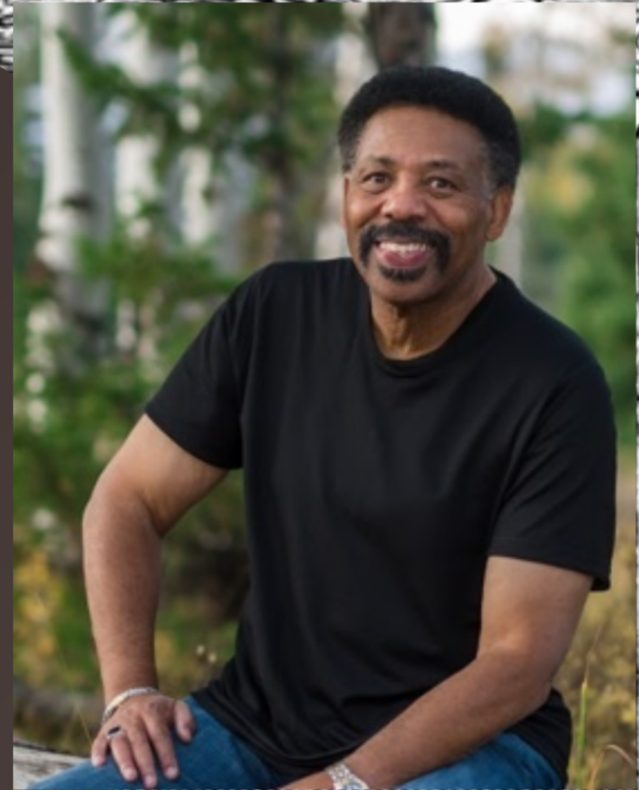
Tony Evans, Bible Teacher and Commentator

The doctrine of inspiration refers to the process by which God oversaw the composition of Scripture, guiding the authors to write exactly what he wanted them to write without error ... Our God communicates. And he has worked supernaturally through the Holy Spirit to communicate perfectly to us through all of Scripture, which is the Word of God. When we read the Bible, we are reading the very words of the living God.