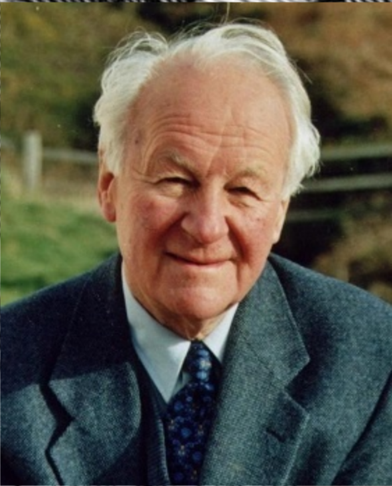
John Stott (1921 - 2011)

This kind of summons is ... specially relevant whenever innovators arise in the church, 'radicals' who claim to be progressive and who repudiate everything which savours of the traditional. ... To be sure, the church of every generation must seek to translate the faith into the contemporary idiom ... But a translation is a rendering of the same message into another language; it is not a fresh composition.