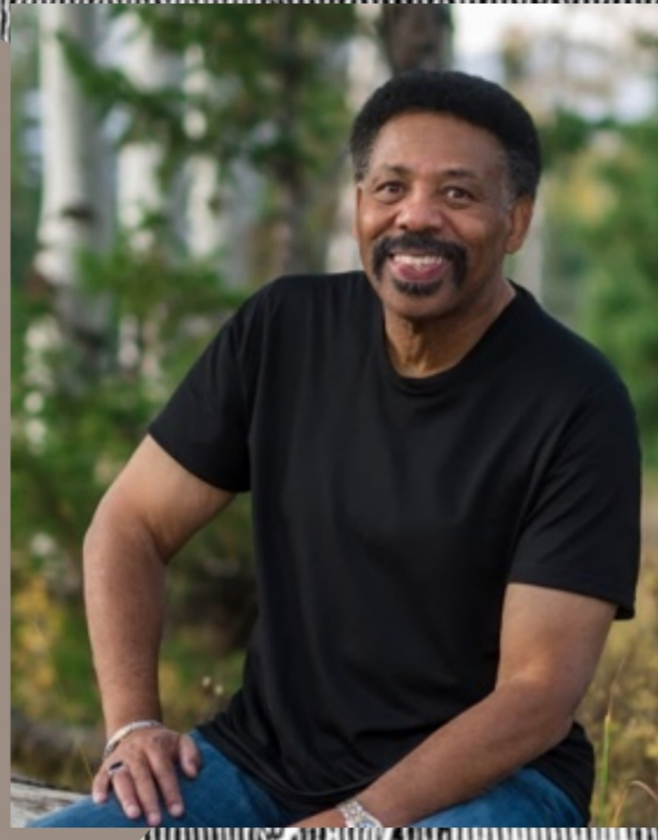
Tony Evans, Bible Teacher and Commentator

It was important for Timothy to gain right perspective in the face of the stresses and strains, demands and disappointments of ministry. Paul wanted to encourage him by his own testimony of having fought the good fight and finished his own race (4:7). Paul didn't throw in the towel when things got tough; he chose the right battles to fight and he won them. He desired Timothy do the same.