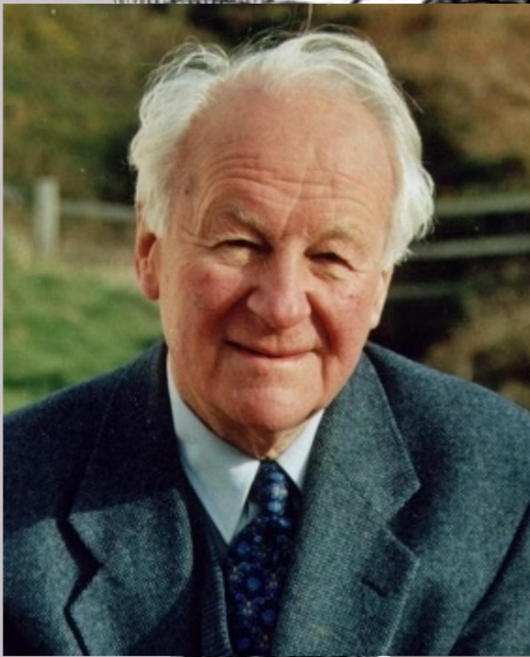
John Stott (1921 - 2011)

It is the undeserved freeness of the gospel which offends. The 'natural' or unregenerate man hates to have to admit the gravity of his sin and guilt, his complete helplessness to save himself, the indispensable necessity of God's grace and Christ's sinbearing death to save him, and therefore his inescapable indebtedness to the cross.