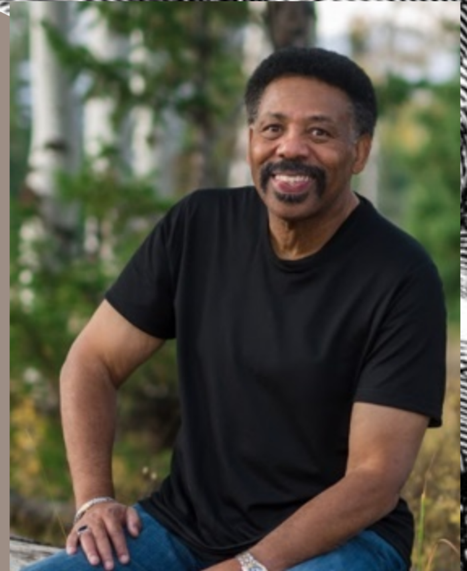
Tony Evans, Bible Teacher and Commentator

When trials and tribulations strike, remember that God is sovereign. When you think more highly of yourself than you ought, remember that God is sovereign. When your life hits rock bottom, remember that God is sovereign. The worst nightmare of the wicked is that God is sovereign. The overruling hope of the saint is that God is sovereign.