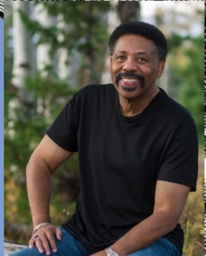
Tony Evans, Bible Teacher and Commentator

Though outsiders may not believe what the church teaches, they should be able to respect the overseer for his character and integrity.