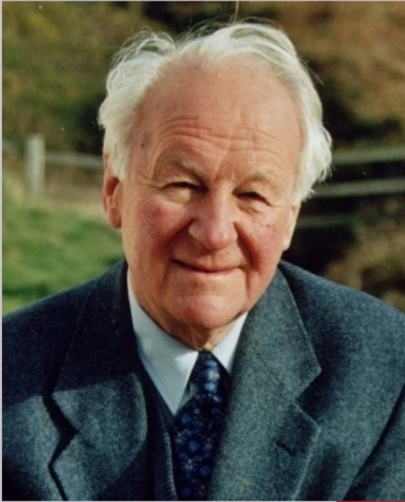
John Stott (1921 - 2011)

In conclusion, Paul's perspective in this chapter is to view the presbyters and the deacons in the light of the church they are called to serve, and to view the church in the light of the truth it is called to confess. One of the surest roads to the reform and renewal of the church is to recover a grasp of its essential identity as God's household, the church of the living God, and the pillar and foundation of the truth.