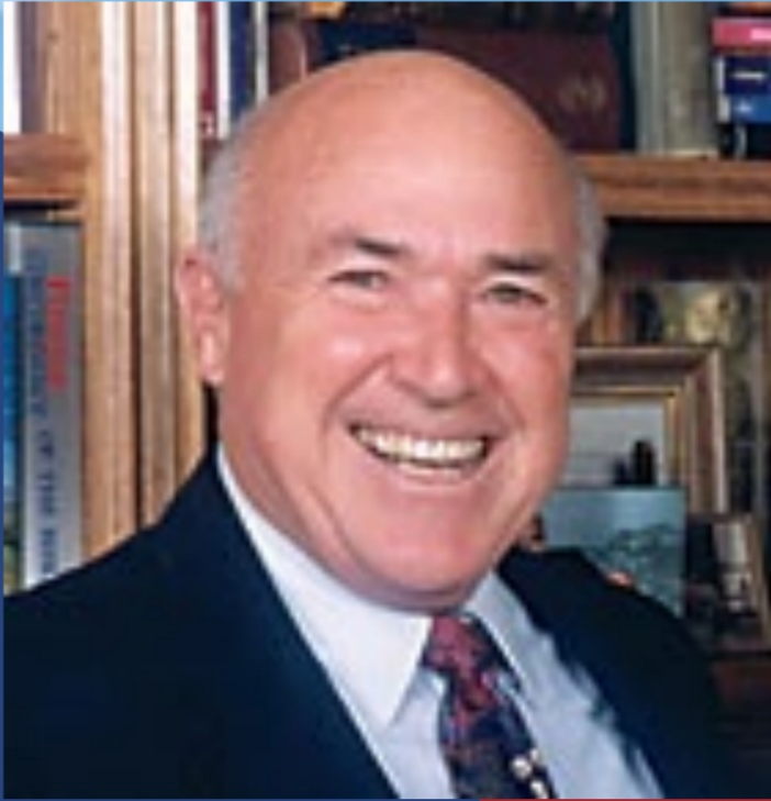
Chuck Smith (1927-2013), founding pastor of the Calvary Chapel Movement

When judgment proceeds from God, the righteous are spared because God's judgment is against sin. But, thank God through Jesus Christ, our sins have been forgiven! Thus, when the judgment of God comes on this earth, His people [aka "the church"] will not be here. This is the blessed hope of every believer. Well, not every believer, because some believe they are going to go through the Great Tribulation. But it is the blessed hope for those who believe in a pretribulation Rapture.