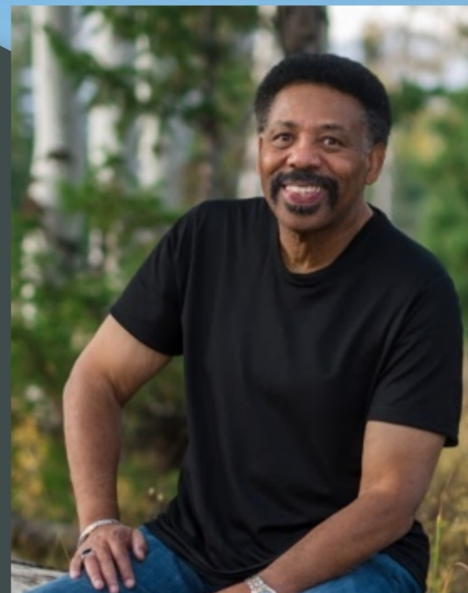
Tony Evans, Bible Teacher and Commentator

[Many people] want to hear about the times and the seasons—that is, they want a timeline for Jesus's return. But the illustrations Paul uses here remind us that we will not get one. After all, if we're busily looking at dates on the calendar we'll fail to look for the Lord. Jesus's second coming is imminent—that is, we should expect him to return at any time. It could be tomorrow or it could be in a hundred years. One thing is certain: It will be a surprise for people who do not expect it.