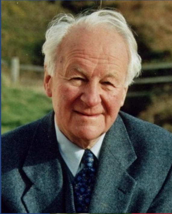
John Stott (1921 - 2011)

[O]nce the uniqueness of the biblical prophets (and apostles) has been conceded, we should be ready to add that there are today secondary and subsidiary kinds of prophetic gift and ministry. For God undoubtedly gives to some a remarkable degree of insight either into Scripture itself and its meaning, or into its application to the contemporary world, or into his particular will for particular people in particular situations. It seems to be quite legitimate to call this insight 'prophetic' insight and this gift a 'prophetic' gift.