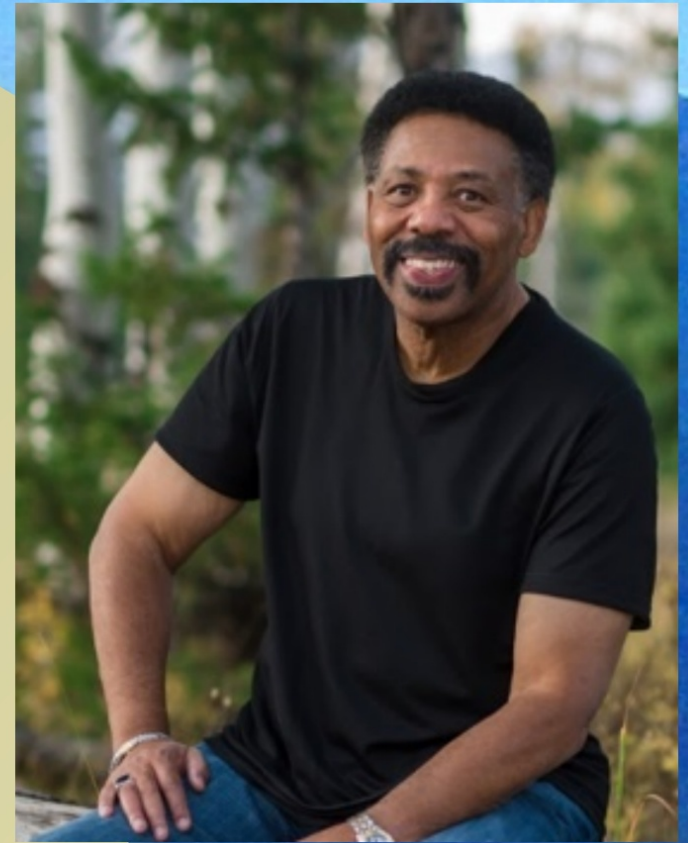
Tony Evans, Bible Teacher and Commentator

Paul ... says in essence, “Take a good look at heaven’s perspective on every issue, so you will know how to live on earth.” ... To help the Colossians develop a new mentality, Paul reminds them of their new identity. ... If Christ is your new identity (that is, if you’re a Christian) and heaven is your new location (you’re physically on earth but participating in the spiritual realm), then you’re called to live from that new perspective. Decisions are to be informed by an eternal, heavenly perspective rather than an imperfect, earthly one. We need a Christian view of the world—a kingdom worldview.