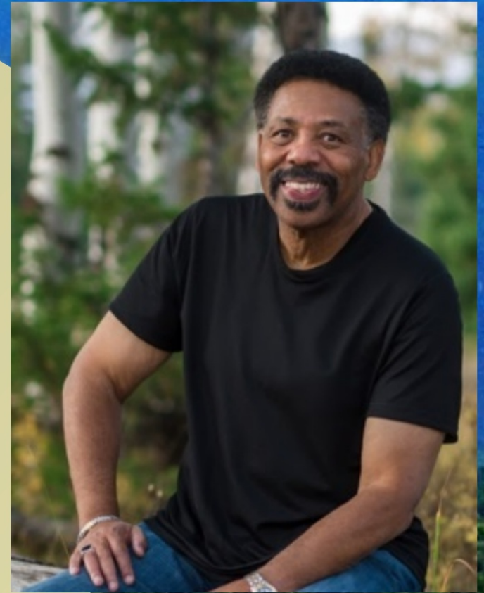
Tony Evans, Bible Teacher and Commentator

Ultimately, regardless of our occupations, we all serve God and are accountable to him for the quality of our work. Therefore, we should serve our employers wholeheartedly, rather than being people-pleasers who work only when being watched. You live before a sovereign God who sees everything you do. His rewards for your faithfulness are better than any raise you can receive. ... Let your motivation be spiritual. Since you work for God, you are to produce excellence. Since you produce excellence, you should satisfy your earthly employer and your customer. Make no mistake: with God, nothing goes unnoticed.