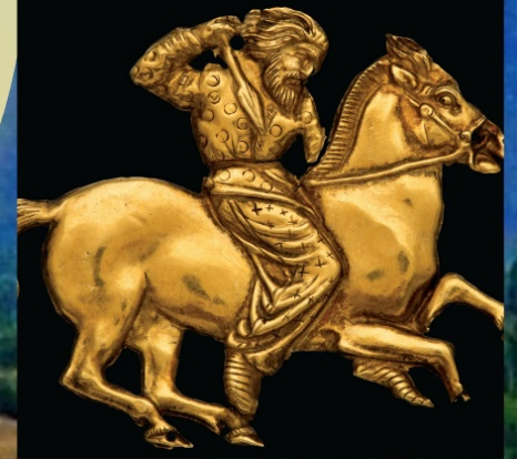
Scythian Warrior (British Museum)