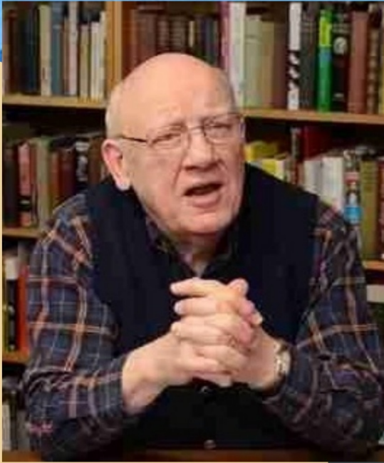
Warren Wiersbe (1929 - 2019), pastor and Bible teacher.

The Word will transform our lives if we will but permit it to “dwell” in us richly (3:16) The word dwell means “to feel at home.” If we have experienced the grace and the peace of Christ, then the Word of Christ will feel at home in our hearts. We will discover how rich the Word is with spiritual treasures that give value to our lives.