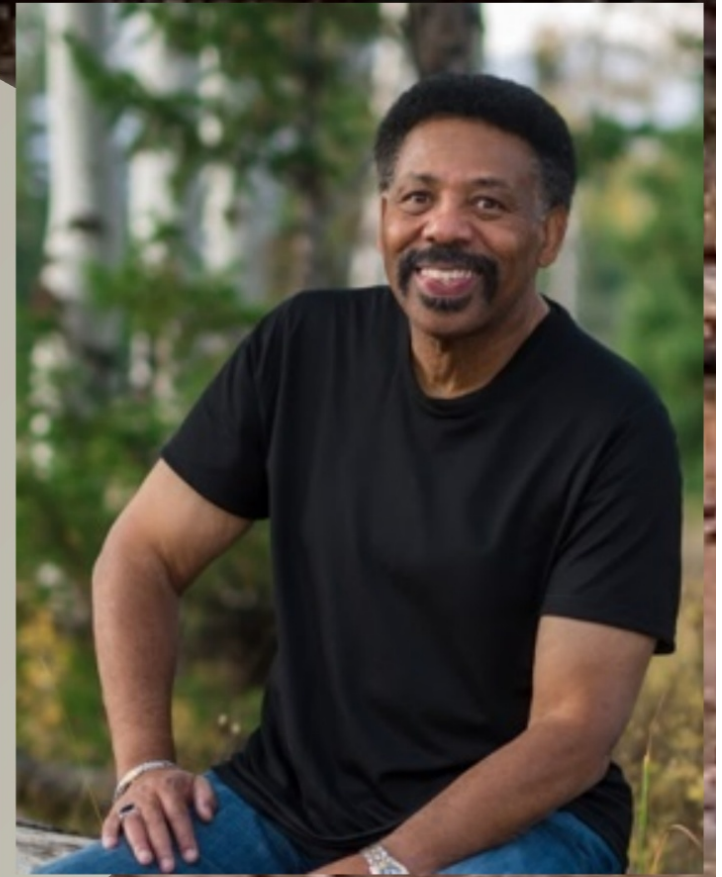
Tony Evans, Bible Teacher and Commentator