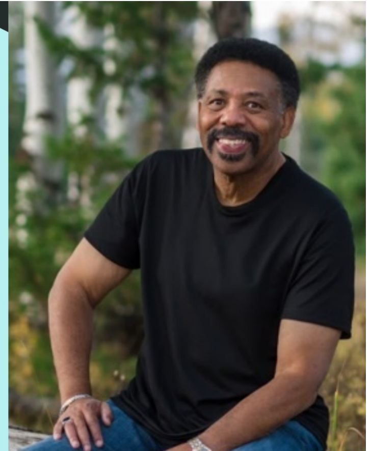
Tony Evans, Bible Teacher and Commentator

This is Paul's most intimate letter to a church; it expresses his heart and his passion. False teachers had entered the church in Corinth, and they were receiving a hearing even though they were undermining Paul's message. They also questioned his kingdom calling and responsibility as an apostle of Jesus Christ. So Paul offered a defense of his ministry because the gospel was being undermined ... The apostle appealed to the Corinthians' hearts and minds, showing them that truth without love is damaging, while love without truth is deceptive.