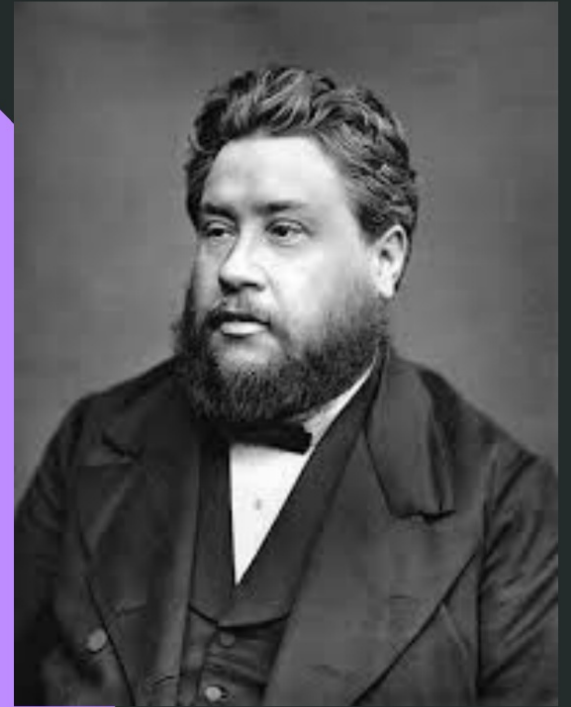
Charles Spurgeon (1834 - 1892), London Pastor

Now, what is it to have Jesus Christ in you? The true Christian carries the cross in his heart; and a cross inside the heart, my friends, is one of the sweetest cures for a cross on the back. If you have a cross in your heart – Christ crucified in you, the hope of glory – all the crosses of this world's troubles will seem to you light enough, and you will easily be able to sustain it. Christ in the heart means Christ believed in, Christ beloved, Christ trusted, Christ espoused, Christ communed with, Christ as our daily food, and ourselves as the temple and palace wherein Jesus Christ daily walks