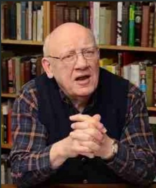
Warren Wiersbe (1929 - 2019), pastor and Bible teacher.

I suggest you read 2 Corinthians 8 and 9 again, and that you note the emphasis on the grace of God. If our churches and other ministries would get back to grace giving, there would be fewer high-pressure offering appeals, fewer gimmicks to raise funds, and fewer complaints from the people of God. Instead, there would be plenty of money available for the ministries that truly magnify the grace of God. And I think that the unsaved people in the world would sit up and take notice!