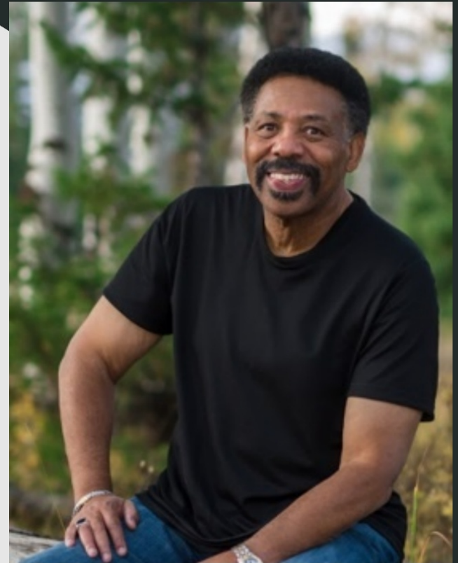
Tony Evans, Bible Teacher and Commentator

Paul is not promising that giving generously to gospel ministry will result in earthly, material prosperity and the elimination of all your problems ... But clearly there's a principle of sowing and reaping here that's not to be ignored. If you give generously to a legitimate need from sincere gospel motives when it is in your capacity to do so, God will give you his blessing.