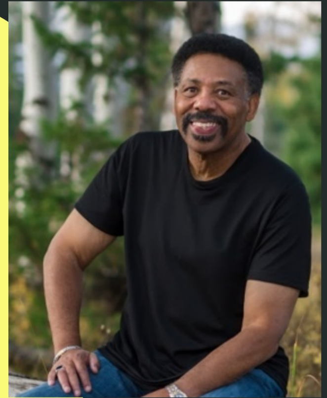
Tony Evans, Bible Teacher and Commentator

When God's kingdom is given priority in your life, you open yourself to waves of grace that are bigger than your gift. History and eternity have more grace available than we could ever access. As a result, the fruit that comes through your service to his kingdom multiplies into greater benefit to you, greater blessings to others, and greater glory to God.