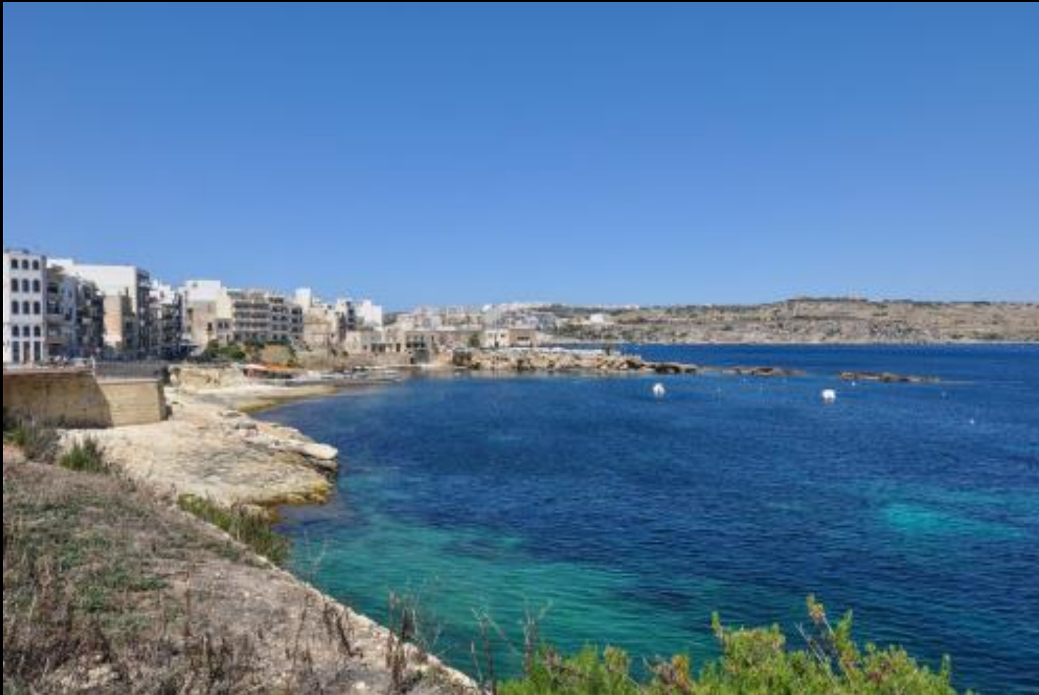
St. Paul's Bay, Malta

https://holylandphotos .wordpress.com/2019/ 07/10/saint-pauls- islands-shipwreck-on- malta-part-2/